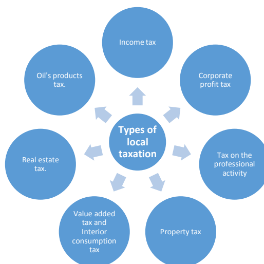
Fig.1. Types of local taxation.

There are different taxes levied, which we can summarize in the following figure.